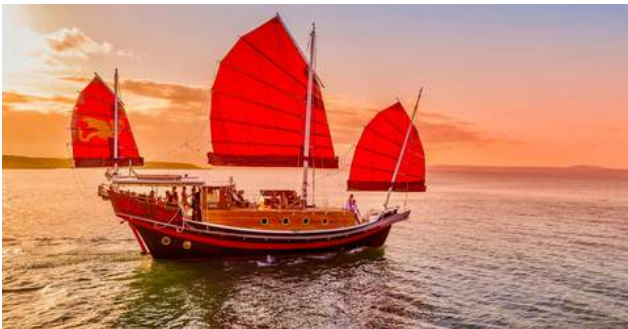
Chinese Junk Boat