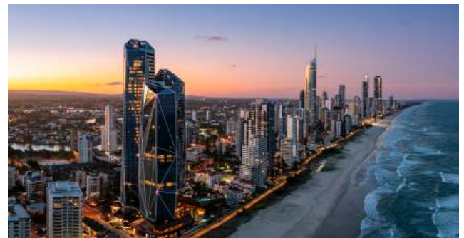
Gold Coast at Night