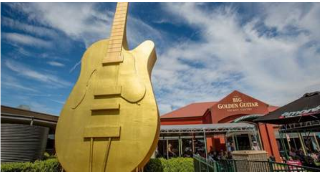
The Big Golden Guitar