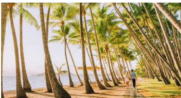
Palm Cove, Tourism & Events Queensland