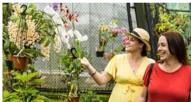
Cairns Botanical Gardens, Tourism & Events Queensland