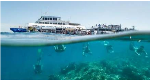
Reef Cruise, Tourism & Events Queensland