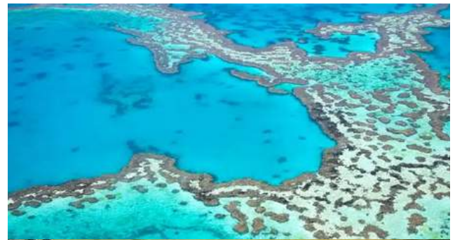
Great Barrier Reef, Scenic Flight