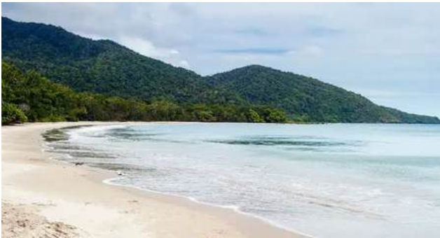
Cape Tribulation Beach