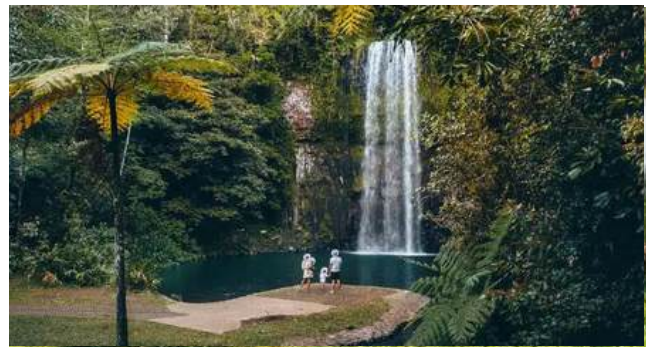
Millaa Millaa Falls