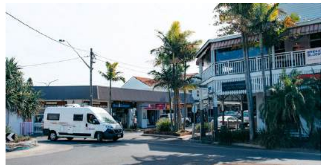
Image: Exploring with Cruisin' made easy with the Sandpiper