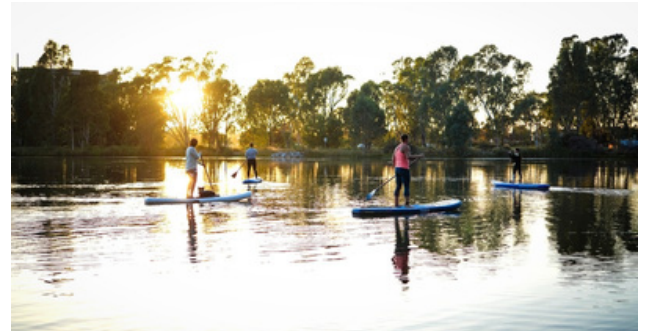
Image: Victoria Park Lake Paddle Boards, Goulburn River