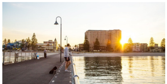
Image: Glenelg Beach