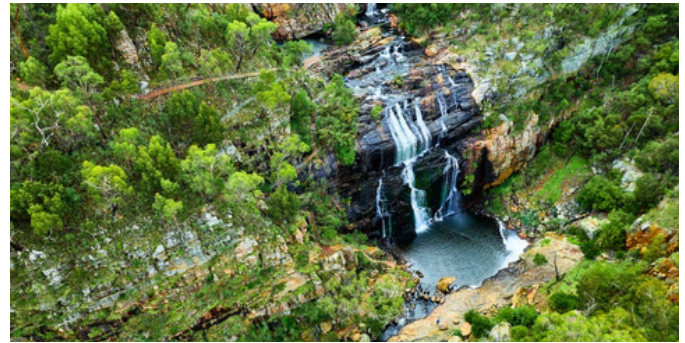
Image: MacKenzie Falls